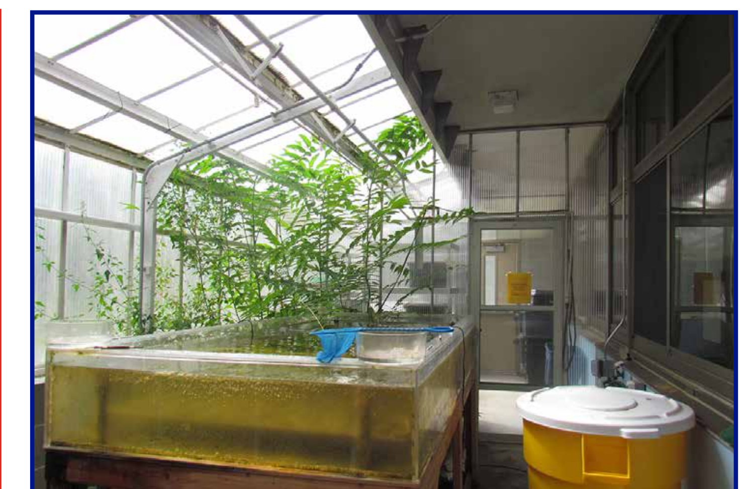
The current Coral Reef Project cannot survive in its current location at CSH Jr./Sr. High School.