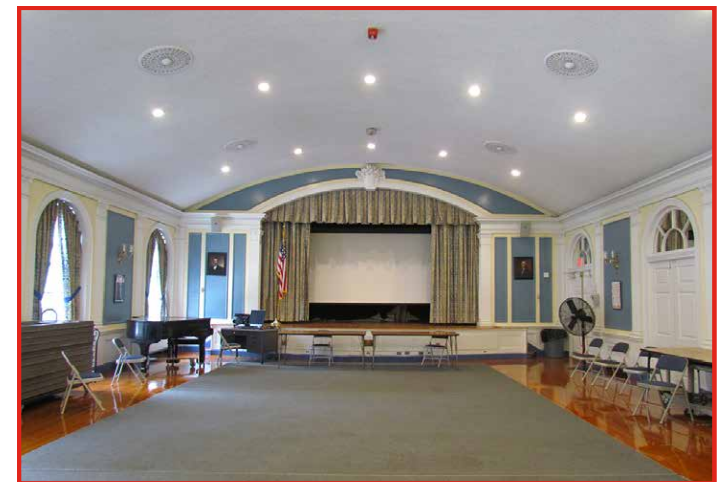
The Little Theatre at Lloyd Harbor Elementary School needs renovation to maximize use.