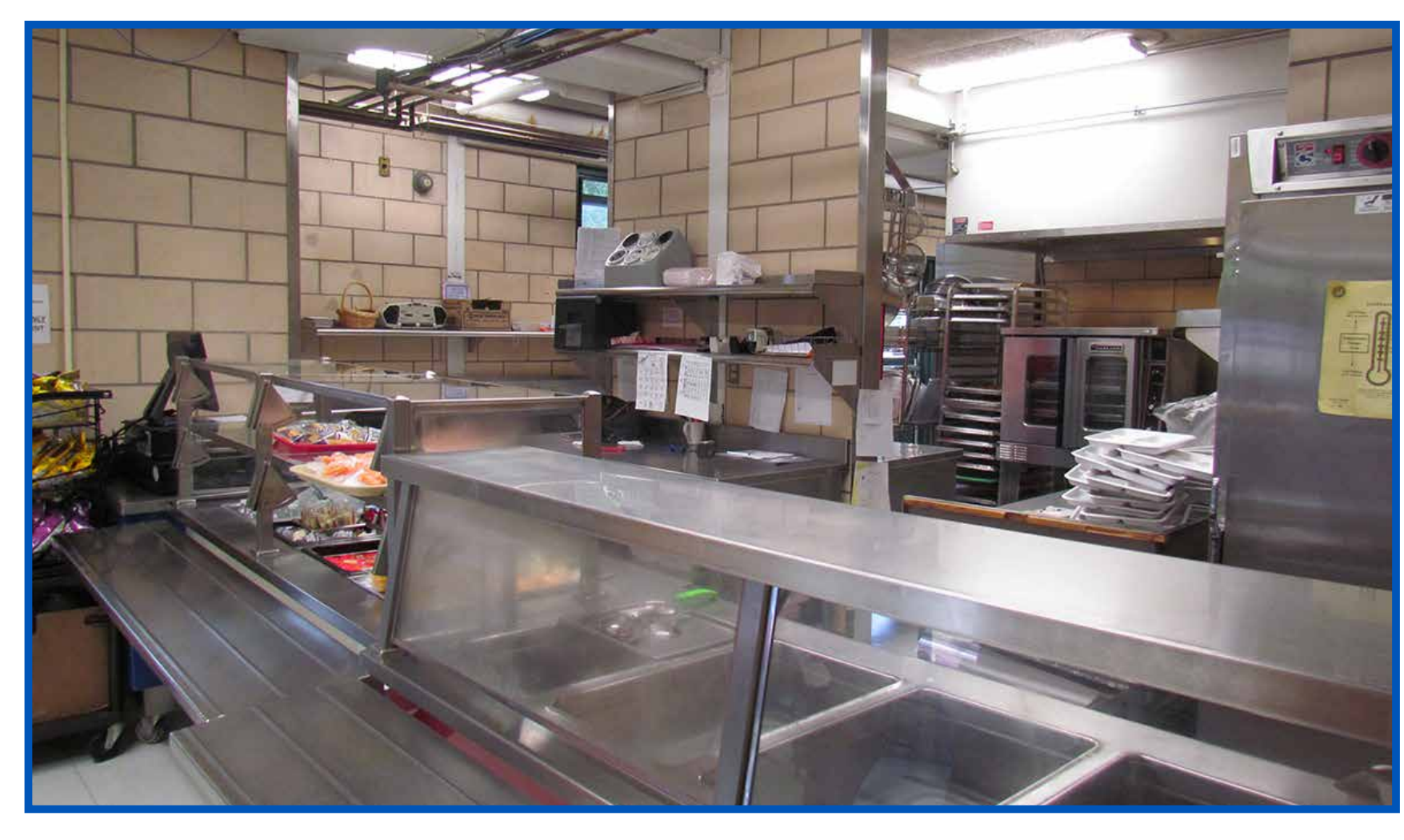
The kitchen at West Side Elementary School is insufficient in space and functionality.