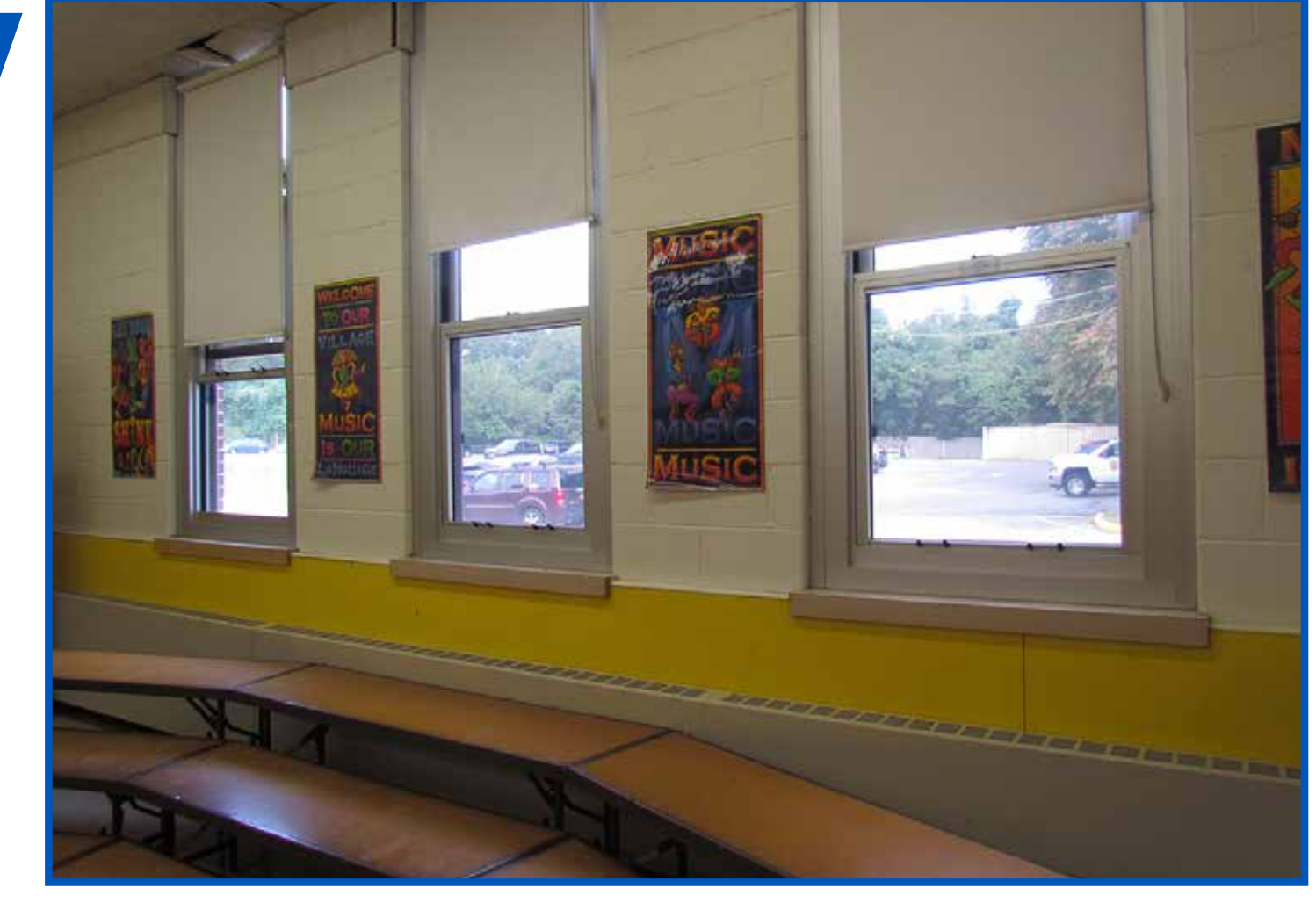
The music room at Goosehill Primary School does not adequately support the music program.